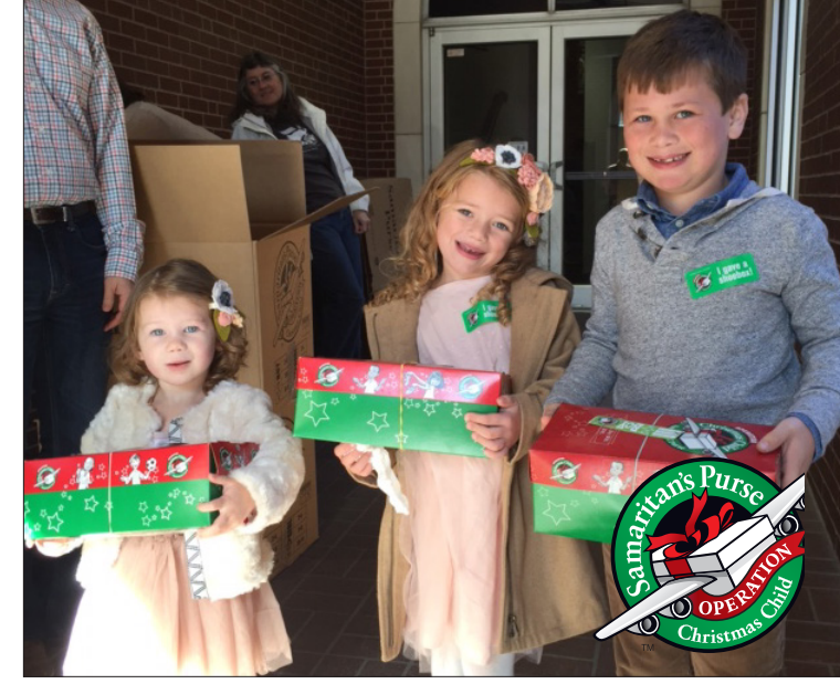
FBC grung TREE

Operation Christmas Child 2016 involved the efforts of 32 plus volunteers packing cases, donating 515 shoeboxes, packing 3,200 boxes at the relay station, and 12 FBC members traveling to Dallas to the Operation Christmas Child process center.