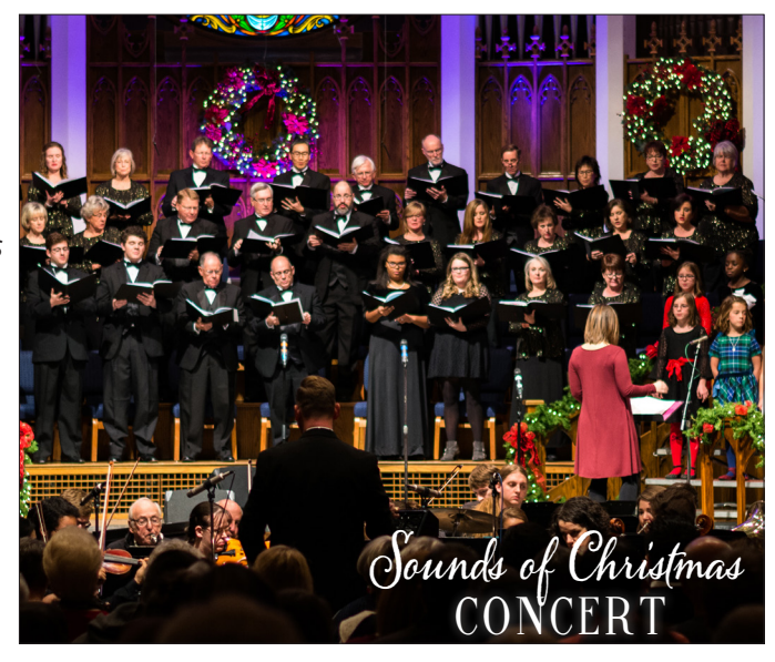
December 11 and December 12.

Operation Christmas Child 2016 involved the efforts of 32 plus volunteers packing cases, donating 515 shoeboxes, packing 3,200 boxes at the relay station, and 12 FBC members traveling to Dallas to the Operation Christmas Child process center.