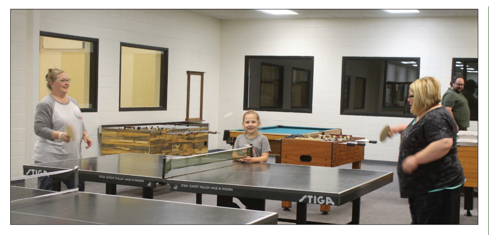
Lincoln Elementary teachers and their families enjoy an end-of-year appreciation night at the FLC.