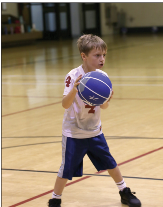
Upward Basketball Camp