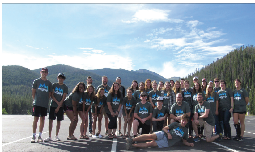
High School Mountain Camp