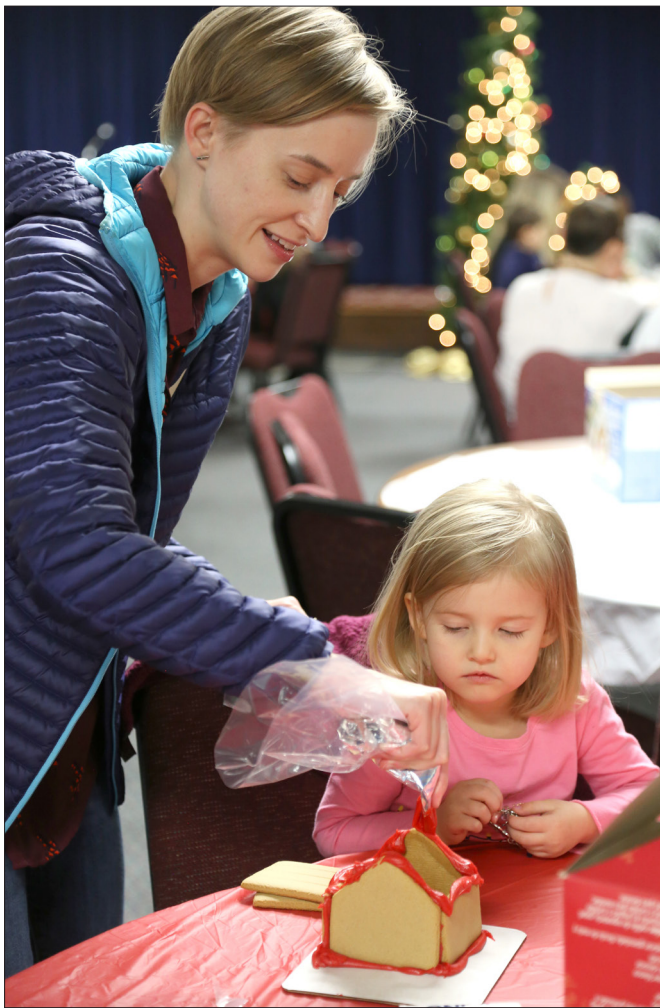
On December 13 there was some serious gingerbread house building skills happening in Hallock Hall as all ages gathered for this family tradition.